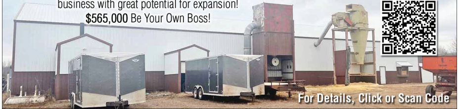
For Details, Click or Scan Code