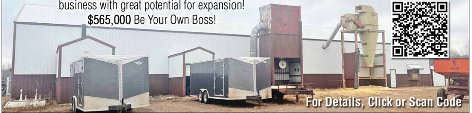
For Details, Click or Scan Code